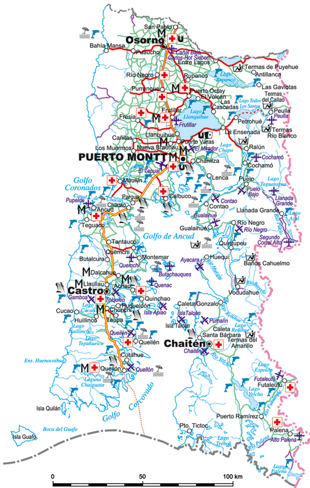
Fig. 1. 10th Region of Chile, "Región de los Lagos", where the Salmon Industry is developed [www.chileeduca.cl, Online; accessed 13-December-2010].