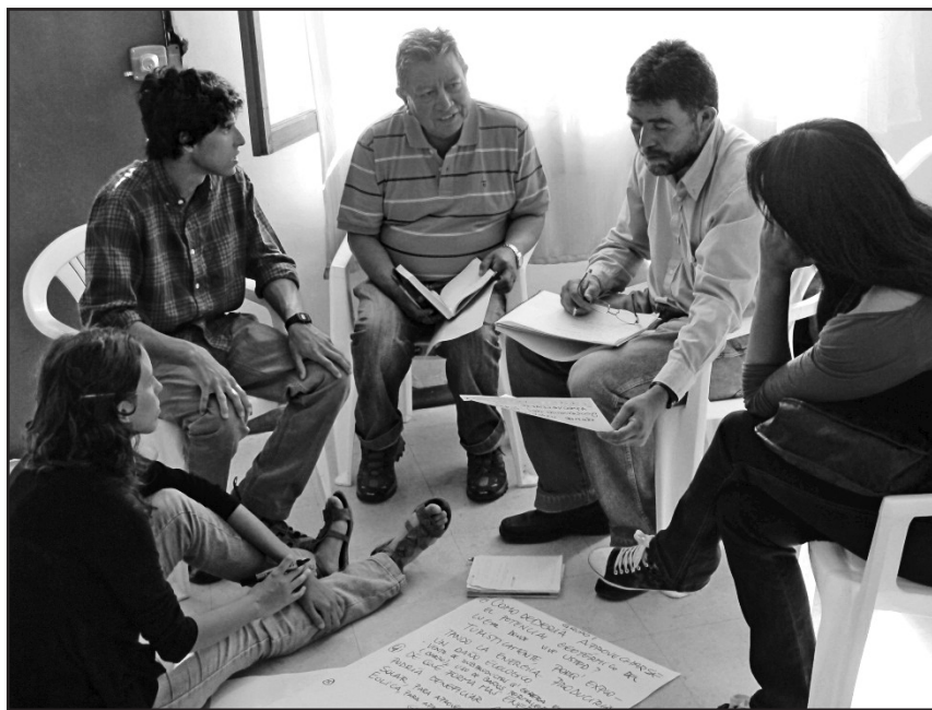
Figure 5. Photo of sustained dialogue participants during January 2013 Seminario Científico-Etnico.

This research was funded by the inaugural Fulbright Nexus program of the U.S. Department of State, the Longhorn Innovation Fund for Technology of The University of Texas at Austin, and the Jackson School of Geosciences Geology Foundation Rapid Response Program. The research team would