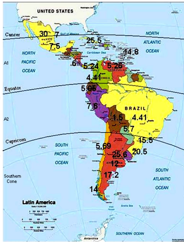
Figure 1. The map of the study area with the prevalence numbers (per 100,000 individuals) shows the distribution of multiple sclerosis (MS) in Latin American and Caribbean (LAC) countries, which are divided in two regions: the intertropical zone (both side of Equator) and the temperate southern cone (below the Tropic of Capricorn).

Cuban provinces was around 10 per 100,000. The latest study, in Cienfuegos province, provides a prevalence of 25.5 per 100,000. 14 In the French West Indies, comprised mainly of an Afro-Caribbean population (>90%) with some interbreeding with the Caucasian population (estimated to be <30%), a crude MS prevalence of 14.8 per 100,000 was reported. Martinique has a higher prevalence of MS (21.0 per 100,000 vs. 8.5 per 100,000) and higher incidence (2.0 per 100,000 vs. 0.7 per 100,000) than Guadeloupe. 15 In other Caribbean countries, epidemiological data are scarce: the findings from several regional studies do not fulfill the diagnostic criteria for our study.