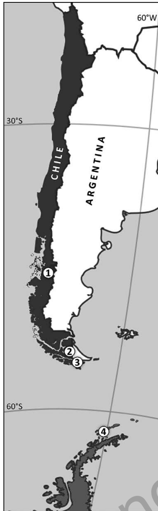
Fig. 1. Sampling sites. The locations of the four sampling sites are shown in Arabic numbers. 1: Coyhaique, 2: Karukinka, 3: Navarino, 4: Deception.

In each sampling site, specimens that were phenotypically different, particularly in the color of the thalli, size of the lobes, presence or absence of reproductive structures and, if present, type of reproductive structures (sexual/asexual), were collected in order to sample most of the existing diversity of Peltigera at these locations. Thalli were sampled at least 1 m from the next closest thallus to avoid resampling the same genetic individual.