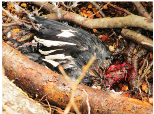
FIG. 2. The body of the dead male woodpecker lying on the ground after an intraspecific agonistic encounter with another male.

Our observations are consistent with previous descriptions of agonistic behavior in woodpecker species, revealing both, new behavioral information, and intraspecific killing as an additional source of mortality for this species.