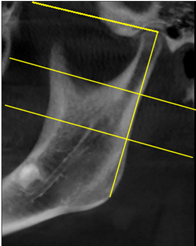
Fig. 2. Cephalometric points on cone beam computed tomography (CBCT).

length on both sides, measured from the mandibular SN.