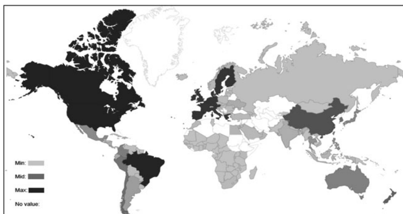
Figure 1. Level of participation in SPS notifications by country (1995–2012).

notify every administrative resolution they make related to a measure; some countries are more exhaustive than others in this sense.