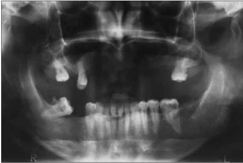
Figure 1. Panoramic radiographic view of a well circumscribed radiolucency in the anterior maxilla; a presumptive diagnosis of residual cyst was made