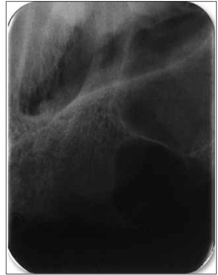
Figure 2. Detail of the radiolucent lesion, which extends to the cortical alveolar process