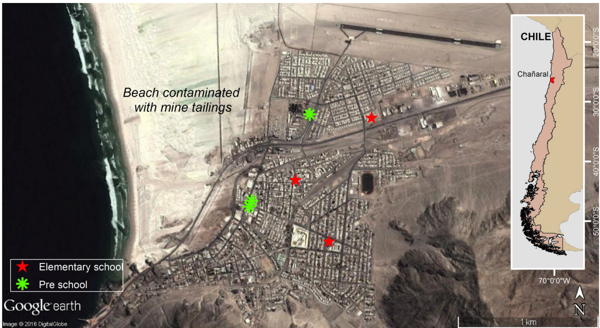
Fig. 1 Map of Chañaral city, Atacama Region, Chile. Schools locations (preschool and elementary schools)

Several studies conducted in Chañaral has determined that PM_{10} particulate matter concentration levels at repeated times exceed the daily Chilean standard of 150 \mu\text{g}/\text{m}^3 (Astudillo 2008; IDICTEC 2001; CIMM 1999). Recently, our research group evaluated the relationship between the levels of PM_{10} and PM_{2.5} on the lung function of Chañaral schoolchildren during the spring–summer period. It was possible to determine that the levels of PM_{10} and PM_{2.5} exceeded national standards and were associated with a decrease in lung function in schoolchildren, especially fine particulate matter (Yohannessen et al. 2015).