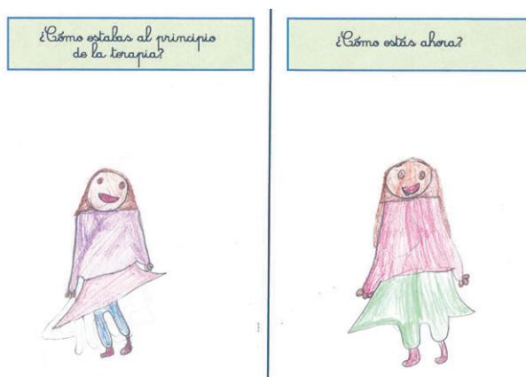
Figure 3. Before and now drawing by Bárbara, a 6-year-old girl.

One of the participants also mentioned changes in terms