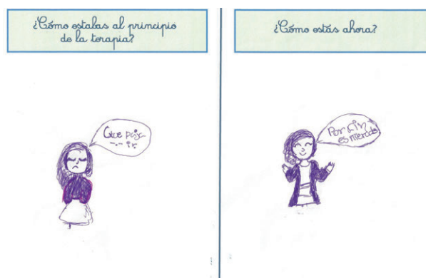
Figure 4. Before and now drawing by Aurora, an 11-year-old girl (the drawing said in the left hand side What a drag!, and in the other side It's Wednesday at last!).

Narrative of the drawing representing the current state of the therapy: Now I'm like: it's Wednesday at last (...) I