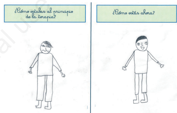
Figure 1. Before and now drawing by Vicente, a 7-year-old boy.

Now I know kids in every class, I know almost everyone (...) (people in my family) tell me I'm more sociable, I talk more now. (Pablo, 14-year-old male)