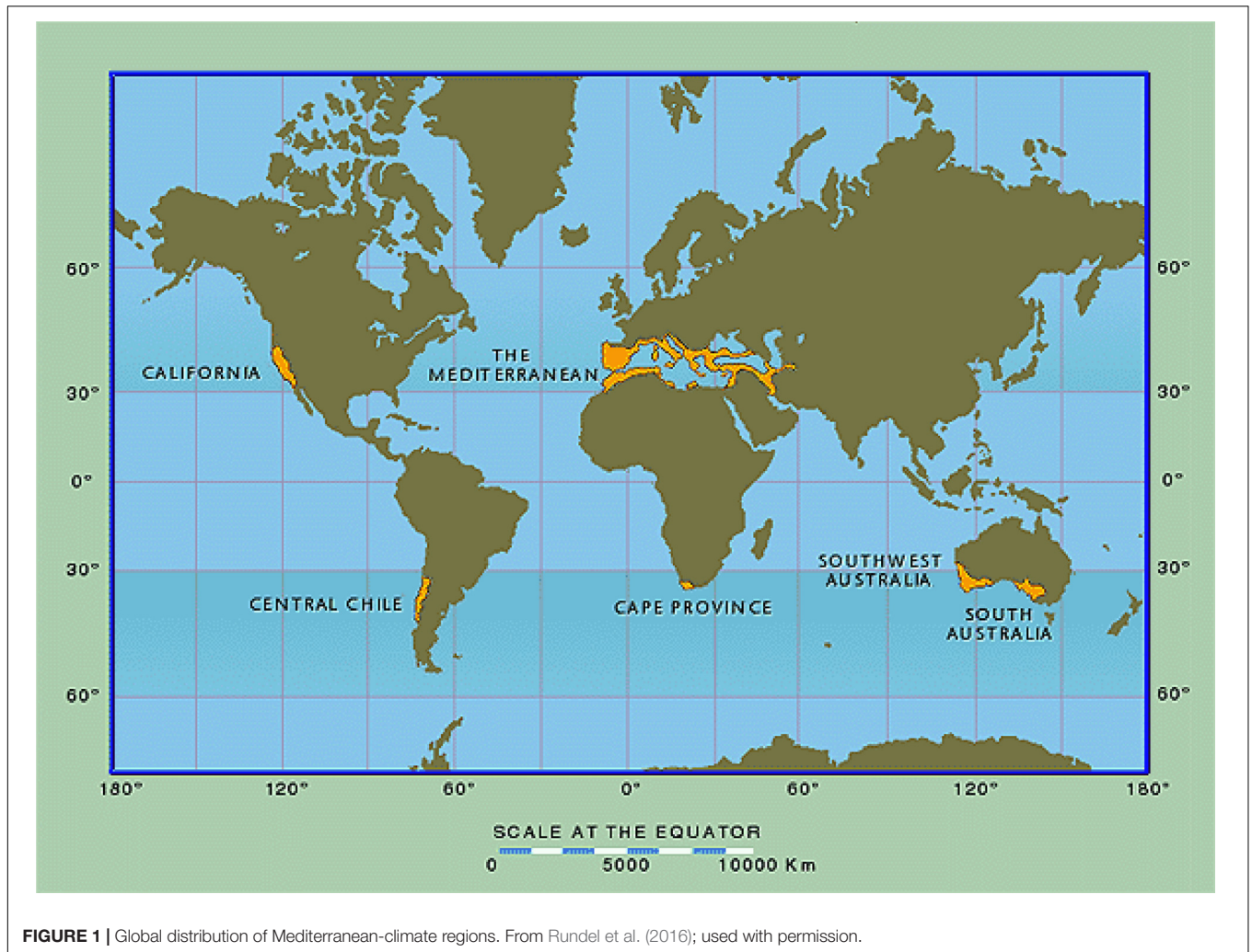
TABLE 1 | Plant species richness and fire-response traits in the five Mediterranean-type climate regions of the world.