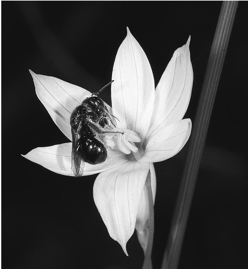
PLATE 1. Plant–pollinator interaction between the solitary bee Manuelia postica (Apidae, Xilocopinae) and Olsynium junceum (Iridaceae) at Los Ruiles Natural Reserve, Chile.

nor sampling evenness influenced modularity, as revealed by the nonsignificant covariation of variables in ANCOVA (Table 2; P = 0.511 and P = 0.824 , respectively). In general, modularity showed a robust pattern to variation in sampling effort.