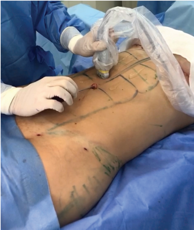
Fig. 1. Surgeon holding an ultrasound probe with the left hand and a cannula with the right hand to perform UGRAFT. The cannula is introduced by an incision in the umbilical region and carefully guided by an ultrasound image until it penetrates the rectus abdominis sheath.

patients undergoing UGRAFT was conducted. Inclusion criteria were Matarasso type 1 patients 7 without skin laxity, body mass index (BMI) <26 \text{ kg/m}^2 for women, and BMI <28 \text{ kg/m}^2 for men. Exclusion criteria were presence of skin laxity and age \leq 18 or \geq 60 years.