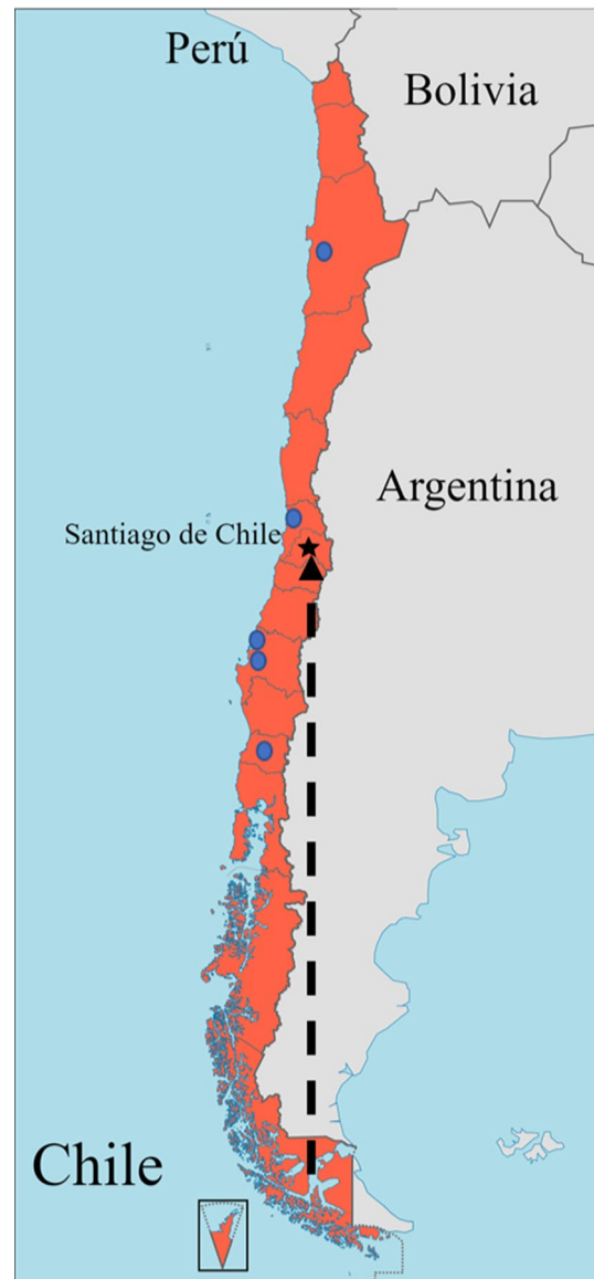
Fig. 3 Location of the 15 ECMO centers in Chile. Chile is located in southwest region of South America; its population is 17.9 million people in over 4.270 km from north to south and 756.945 km 2 including the island territory. Fifteen clinical centers have the ability to provide ECMO support distributed in only 6 cities [10 in Santiago (black star), and 1 in Concepción, Talcahuano, Viña del Mar, Antofagasta and Temuco (blue dots)]. The arrow shows the distance traveled in mobile ECMO with the patient

When the need for ECMO is confirmed, each patient is referred to one of the 29 available beds in ECMO centers throughout the country [15]. Currently only one center in Chile transport ECMO patients on a regular basis, although they have been done sporadically by others. In 2018, 160 ECMO supports were made in the Chile, and 25 required ECMO mobile (Chile National ECMO survey 2018, unpublished data). Figure 3 shows map providing information on the location of ECMO centers in the country.