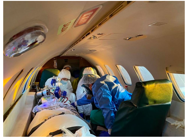
Fig. 2 ECMO air transport: Airborne transfer lasted 4.5 h (3019 km distance). During the flight, the patient remained with her endotracheal tube clamped. All the team members, used air-borne transmission adequate PPE

Prone position ventilation for 48 h and ultrafiltration through the circuit to reach negative water balance were implemented. Native lung function progressively improved and decannulation was undertaken on day 6th