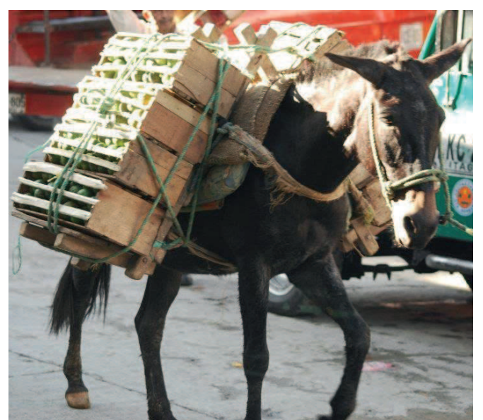
Mule transporting food to a market in Colombia

but a key difference between this and previous studies is that the authors evaluated equids before the start of the working season. The study reports that 80 per cent of the equids examined were underweight, 40 per cent had open wounds, 47 per cent were lame, 70.6 per cent had pain in the vertebral column, 42 per cent had a negative reaction when people approached them and 38.2 per cent exhibited signs of fear and distress.<sup>11</sup>