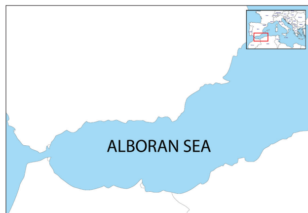
Fig. 1: Map of the Northern Alboran Sea (Geographical Subarea 1 according to General Fisheries Commission for the Mediterranean, GFCM division).

Total length (TL, cm) from the tip of the snout to the tip of the longer lobe of the caudal fin was recorded by a measuring board. Total body weight (TBW, g), liver weight (LW, g), digestive weight (DW, g) and fillet weight (FW, g) were recorded using a balance to the