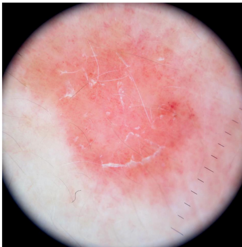
Figure 3 Dermoscopy shows a pink background with dotted and glomerular vessels, and fine white scaling.