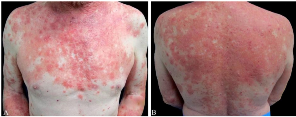
Figure 1 (A and B) Erythematous papules and plaques with well-demarcated areas of spared skin on anterior thorax and back.