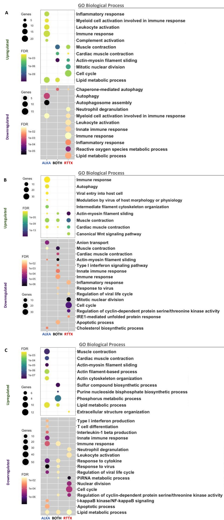
Figure 2. Functional enrichment analysis of differentially expressed genes in fish challenged with RTTX and ALKA at days 1 (A), 7 (B), and 20 (C) post-challenge. Up- and downregulated genes are